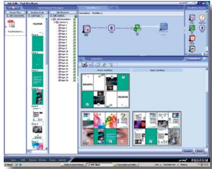
Workflows are built graphically via a simple interface.

XMF's unique 3D proofing capability allows you to create a dynamic simulation of the finished product before the job is processed. An interactive 3D proof can be sent to customers to view their job as a virtual publication in which they can turn pages, checking layout and color; even spot varnishes and stock choices can be simulated. As well as assisting in visualization, this acts as an additional check before any media or production costs have been incurred.