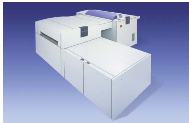
MA-L 6600 multi-cassette autoloader specifications