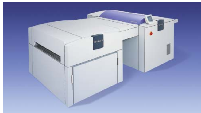
SA-L 6600 single-cassette autoloader specifications

The PlateRite 6600 is supported by an automatic processor bridge, which extends the automation process all the way through to the plate processor.